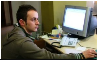
Dhimitri Plasa Municipality, Directory of Information

I am very happy that I was given the chance to do the internship near the municipality of Korca.